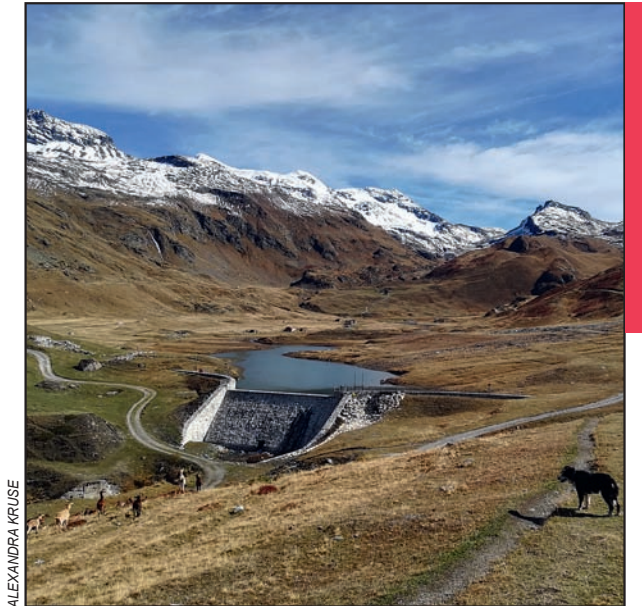
Commons in France used for transhumance.