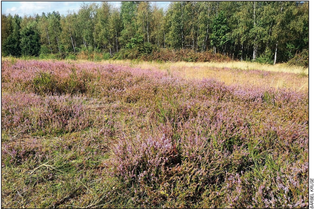
Figure 5: Commons in Germany used for transhumance creating heathlands.

to transhumance as such, e.g. herder or cheese-maker, or take advantage of opportunities within tourism, e.g. provide accommodation, food or guided tours (Mastronardi, Giannelli and Romagnoli 2021; Colombino and Powers 2022; Filak and Gorišek 2022; Mannia 2022). Knowledge communication is also a tourism related employment opportunity (Belliggiano, Bindi and Ievoli 2021).