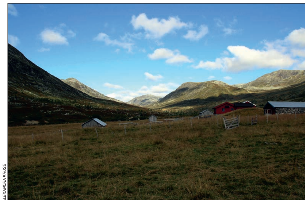
Figure 7: Vertical transhumance depends on seasonal farms as for example in Norway.